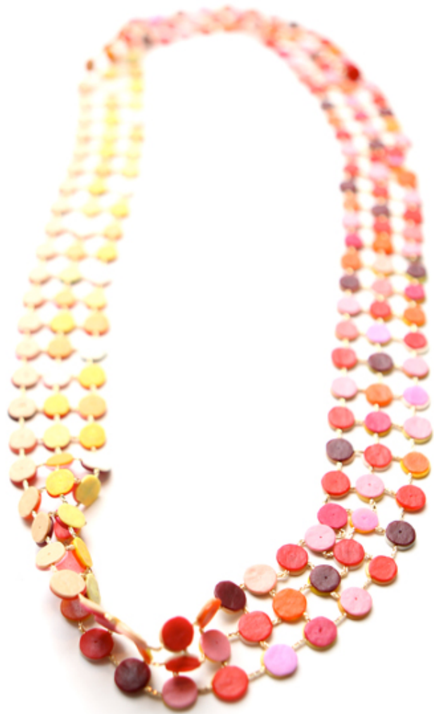
Karola Torkos` handcut fused plastic discs on textiles thread. Can be worn on both sides.