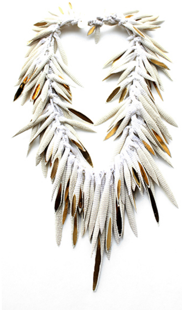
The designs of Parisian artist Tzuri Gueta, mimics organic lives using silicone, silk thread and gold leaf.