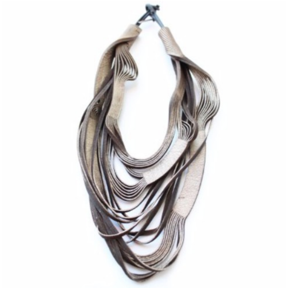
Vegan leather neckpiece, by Oropopo - husband and wife duo based in New Mexico.