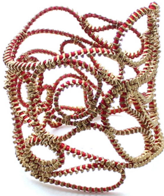
Kate Cusack uses zippers to create beautiful jewelry pieces. here her bracelet with magnetic clasp.