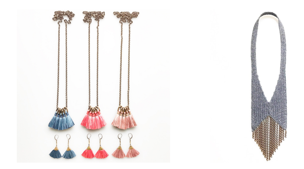
Emily 's work tests the collaboration between metal and fiber. She investigates forms which balance drape and composition. The necklace in the image is crocheted cotton with brass chain. For this show Emily is playing with new colors in dyed silks.